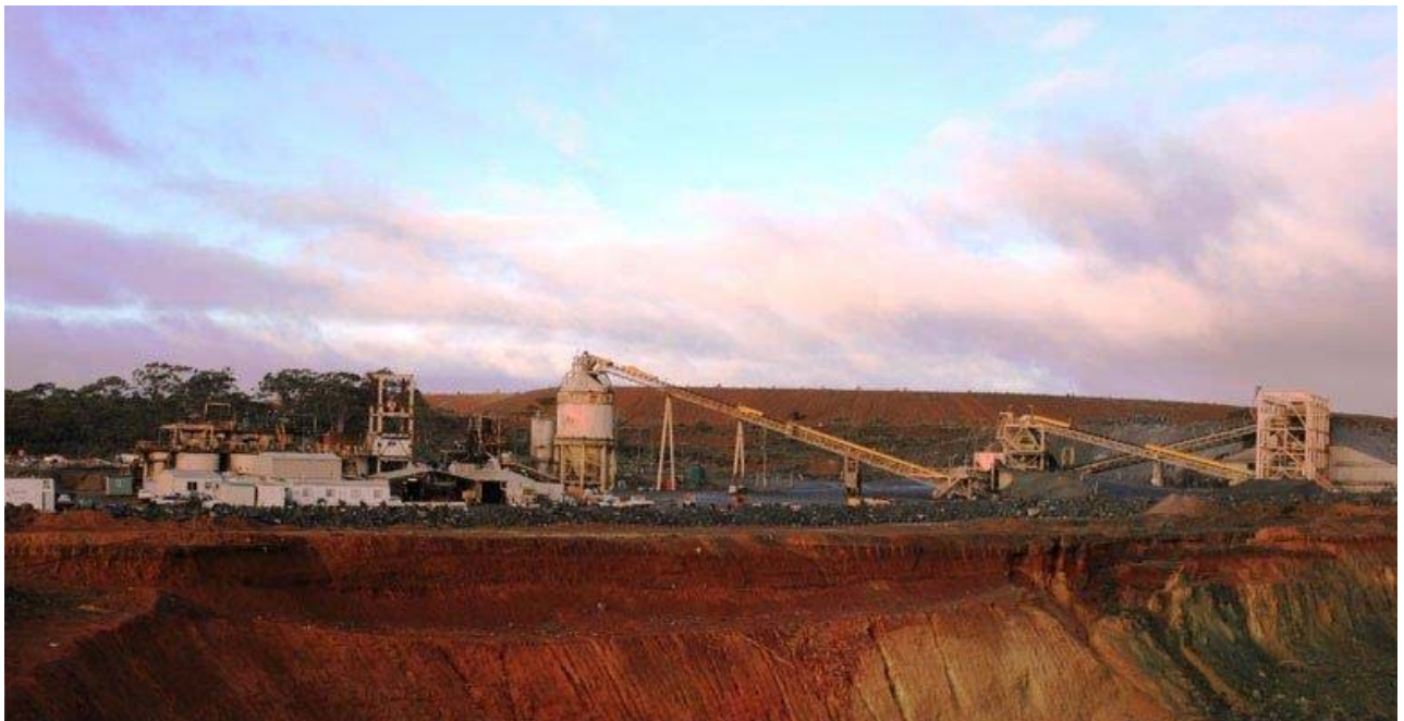
Figure 3: Greenfields Mill, Coolgardie Western Australia

Beacon continues to deliver ore to the mill as the Company progresses towards Milling Campaign 4 which has been rescheduled for early March 2015.