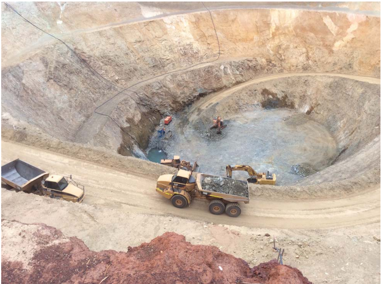
Figure 1: Halleys east Pit- 17 January 2015 RL 394

The focus of the mining during this quarter has been to progress the main open pit at the Company's operations at Halleys East.